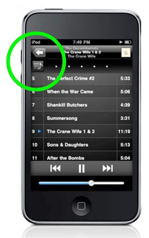
Fig. 3a Fig. 3b

The application will offer the option to purchase each song through an Online Music Store. When a user swipes his finger from left to right across any song, it will reveal the option to purchase the file ( see fig. 4 ).